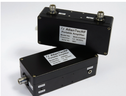
▲ Fig. 3 Model BOX battery-powered amplifier.