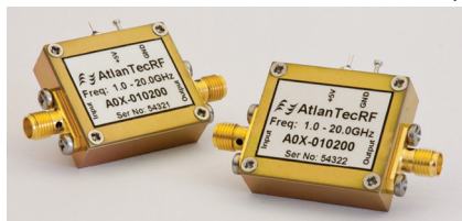
▲ Fig. 1 Model AOX multi-octave amplifier.

The extra versatility provided by the broad bandwidth and temperature range offers benefits in cost and logistics, making the AOX suitable for many applications in test and measurement, telecoms, radar, countermeasures and other demanding military and civil applications. The 4°K model is ideal for radioastronomy and other instrumentation situations where high gain is required at low temperature, together with the ability to perform reliably at the higher temperatures experienced during setting-up and during the transition down to the operating temperature.